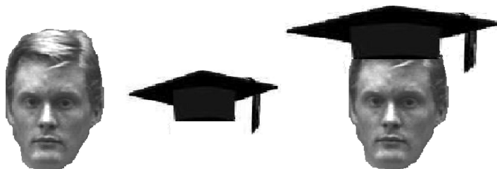
Figure 1. Examples of face–hat stimulus pairs employed in this study.

In the encoding phase, 32 face–hat pairs were presented to participants on a computer screen by SuperLab (Cedrus, Inc.) for 4 s each, and participants were instructed to rate face–hat compatibility by verbal response, using a scale of 1–5. They were also instructed to remember the faces for a subsequent memory test. Each participant performed four training trials before beginning the experiment.