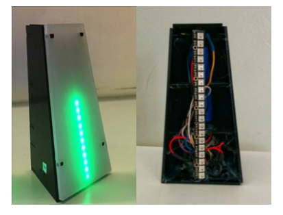
Figure 1. Left: active object. Right: uncovered object.

TangiPlan objects are 3D-printed in the shape of a truncated square pyramid. The electronic components embedded inside the objects include a Spark Core board with an on-board WiFi capability, a NeoPixel RGB LED Stick, and a Lithium Ion cylinder-shaped battery. The entire front panel is transparent to allow LED lights to be easily observed from several angles (see Figure 1). Each object communicates individually with the server to receive updated task time, and to report task completion time.