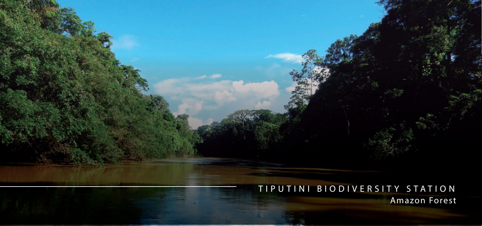
TIPUTINI BIODIVERSITY STATION Amazon Forest