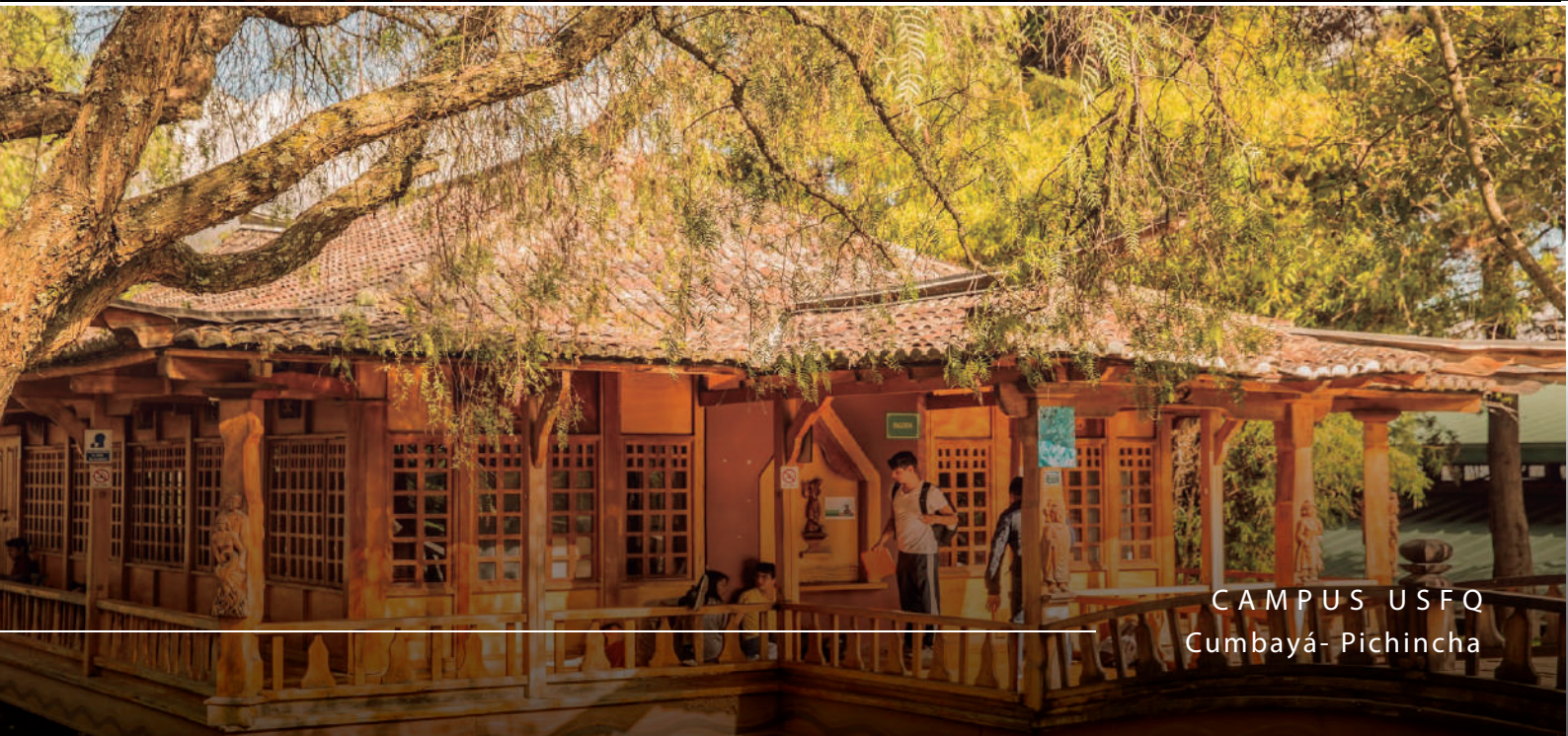
CAMPUS USFQ Cumbayá- Pichincha